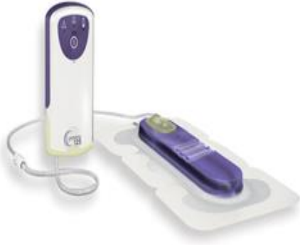
Prevena Wound Care System

This is a handout for you to use as a reference if you should have one placed on your incision site.